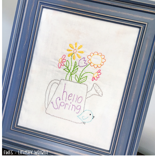
Fort Worth Fabric Studio Designed and Stitched by: Lindsey Weight